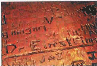
Like many regulars, Albert Einstein carved his name in a table in the inn's bar.

The Tap Room's Wall of Fame displays young, fresh-faced photos of well-known Princeton graduates such as Charlie Gibson, Ralph Nader and James Stewart. Only two women, Brooke Shields and Michelle Obama, grace the wall; women were not admitted to Princeton until 1969. Obama is the first African American in the photo gallery.